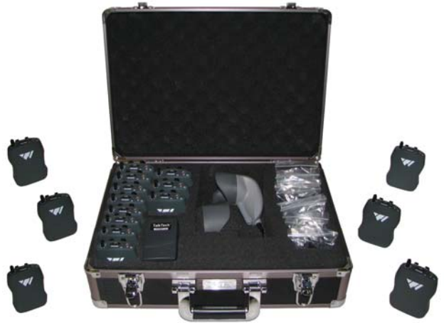
TalkSystem case with Sylencer, earhook earphones, transmitter and receivers.

All TalkSystems are custom-tailored to your needs!